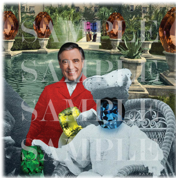
SIR GEM RESORT / MISTER ROGERS