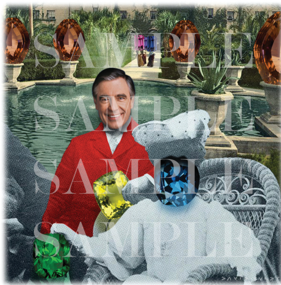
SIR GEM RESORT / MISTER ROGERS